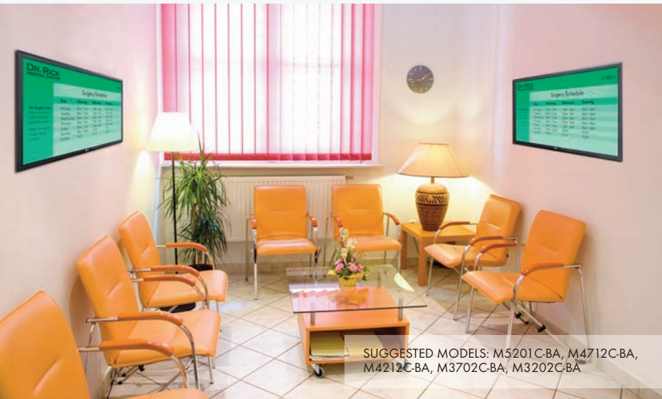
SUGGESTED MODELS: M5201C-BA, M4712C-BA, M4212C-BA, M3702C-BA, M3202C-BA